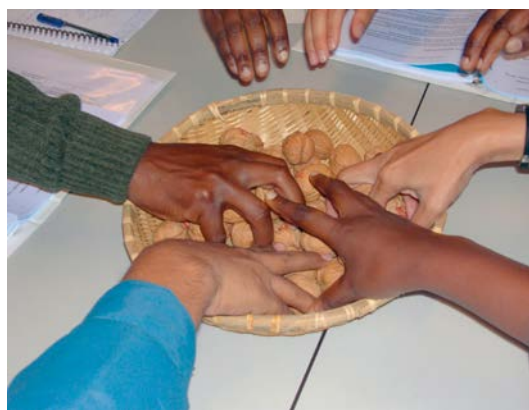
Participants NRM Module 1, 2000, Group 1.

Immediately after the game, the moderator will summarise the total scores of the different teams and the results, including the different strategies followed by the teams, are discussed in plenary. The discussion focuses on the analysis of players' (stakeholders') performance and underlying factors and the attitudinal changes and development of co-operative strategies. Being the basic question: "What did you learn from this exercise in relation to the management of scarce Natural Resources?"