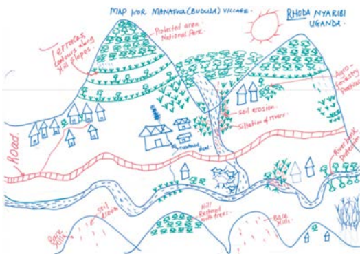
Example of Village Sketch Map, by Rhoda Nyaribi, Participant NRM Module 1, 2005.

Box. 4: Example of a learning exercise in step 3. Diagnosis and reflection on experiences.