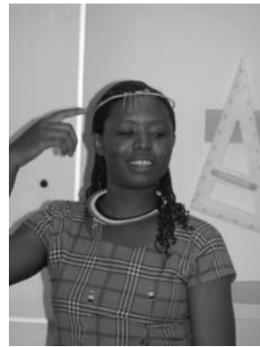
One of the Kenyan students explaining her traditional ornaments, NRM Module 1, 2007

Box. 2: Example of a learning exercise in step 1. Initial expectation and readiness.