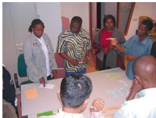
Box. 3: Example of a learning exercise in step 2. Description of students' experiences.